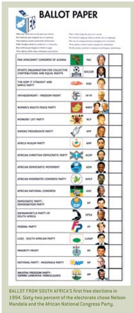
BALLOT FROM SOUTH AFRICA'S first free elections in 1994. Sixty-two percent of the electorate chose Nelson Mandela and the African National Congress Party.

On the Robustness of Majority Rule and Unanimity Rule. Partha Dasgupta and Eric Maskin. Available at www.sss.ias.edu/papers/papers/econpapers.html